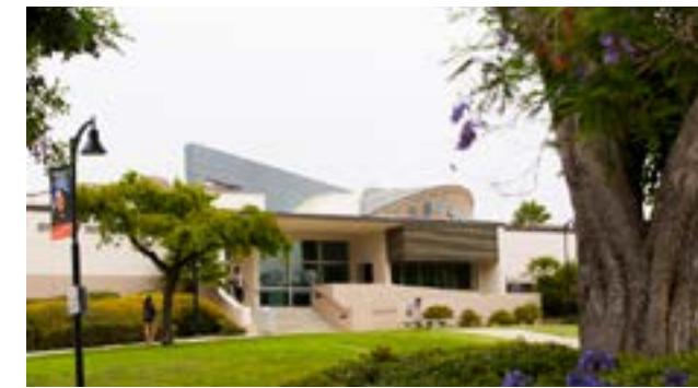
Classes held on Ventura Campus