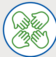
Racism and Discrimination