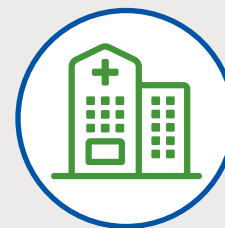
Access to Health Care