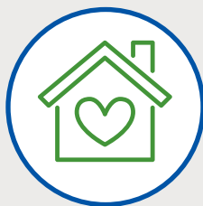
Homelessness and Housing Instability