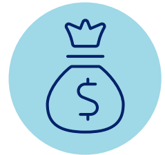
PEER-SELECTED GRANT CAPITAL