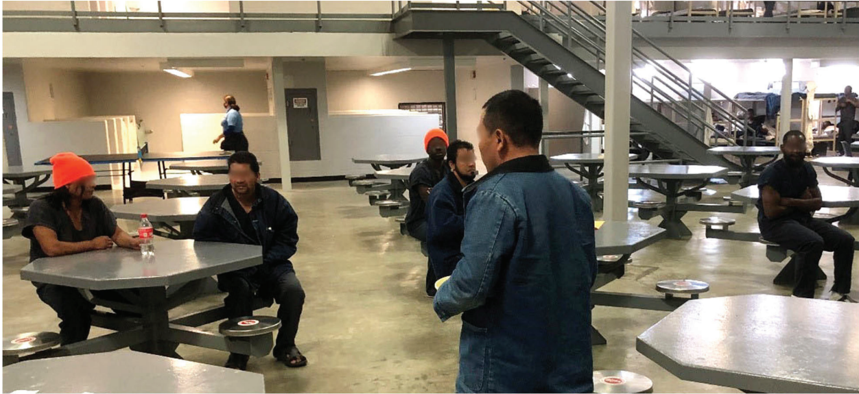
Figure 15. Folkston IPC Detainees in Their Housing Unit Not Wearing Masks and Not Practicing Social Distancing on November 16, 2021