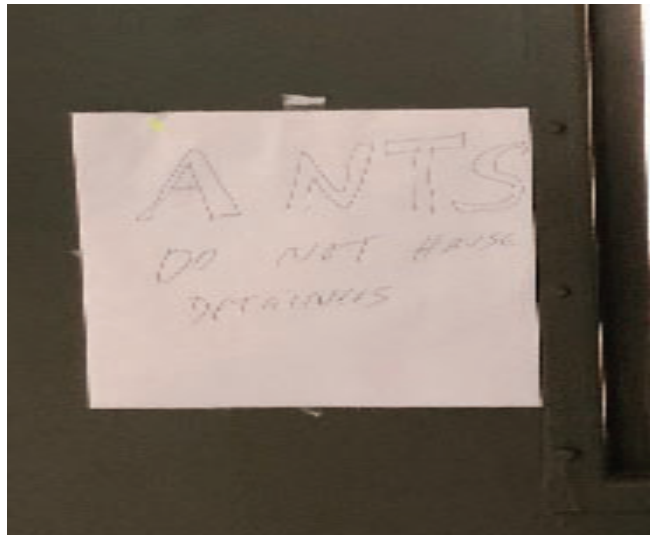
Figure 11. Sign Observed on Cell Door in Folkston IPC Housing Unit, Reading “ANTS: DO NOT HOUSE DETAINEES”

We also observed signs of insect infestation in two parts of the facility. One cell in a detainee housing unit had a sign on its door warning that it should not be used to house detainees due to an infestation of ants, and we saw ants in other detainee cells (see Figure 11).