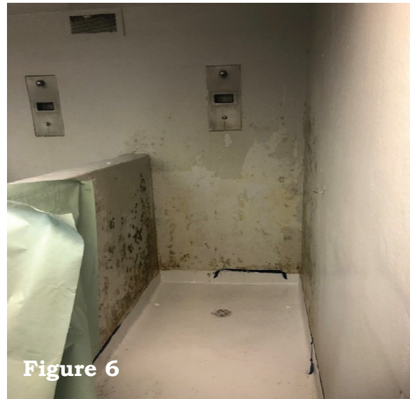
Figures 5 and 6. Showers Observed in Folkston Housing Units Holding Detainees in Poor Condition with Peeling Paint and Mold Present