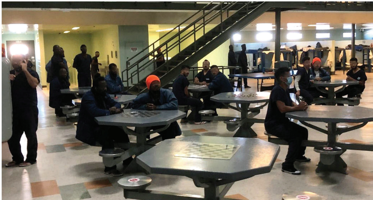
Figure 14. Folkston IPC Detainees in Their Housing Unit Not Wearing Masks and Not Practicing Social Distancing on November 16, 2021

ICE's Pandemic Response Requirements , Version 7, dated October 7, 2021, states all staff and detainees should wear masks, and whenever possible, all staff and detainees should maintain a distance of 6 feet from one another to help slow the spread of COVID-19. Folkston staff told us detainees are required to wear masks at all times when they are inside the facility, including in their housing units, unless they are drinking, eating, or sleeping. However, detainees told us most of them do not wear masks as required, and there are no consequences for not doing so. During our November 2021 walk-through across multiple housing units, we observed numerous detainees within 6 feet of each other and not wearing masks or practicing social distancing, as shown in Figures 14 and 15.