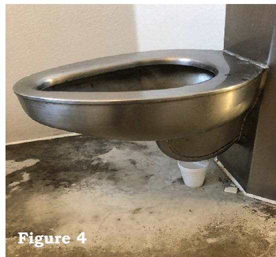
Figures 3 and 4. Leaking Sink (left) and Toilet (right) Observed in Folkston IPC Housing Units Where Detainees Were Held