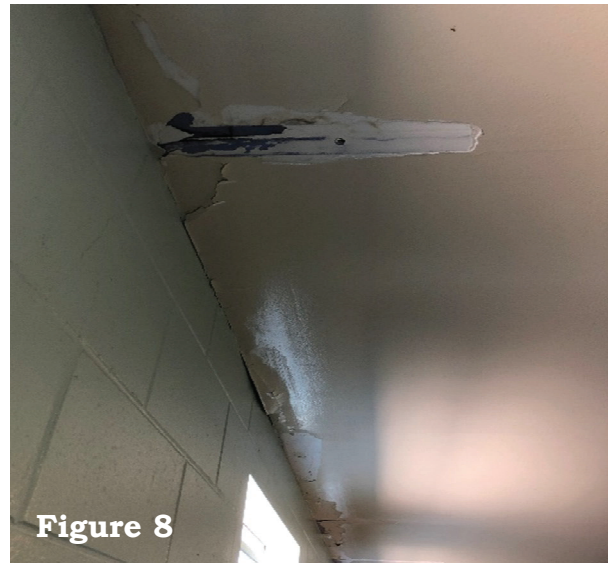
Figures 7 and 8. Blackened Air Vent with Mold Growth (left) and Water Damage Causing Paint to Bubble and Peel (right), Observed in Folkston IPC Housing Units