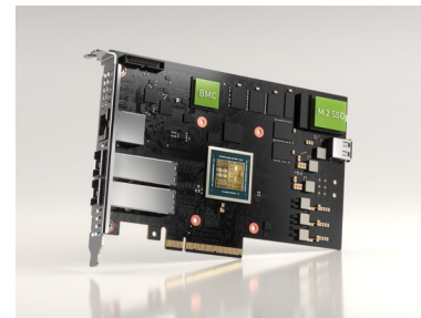
BlueField-3 DPU – 2x 200Gb/s FHHL form factor