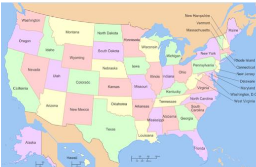
Figure 1. Map of the United States.

Students are better able to recall text when they have music to supplement instruction (Salcedo, 2010). Melodic text is the easiest to remember. In contrast, spoken text, which is often repeated and simple, is the least frequently recalled (Salcedo, 2010). With melodic text, students store the lexical patterns of songs in their long-term musical memory (Fonseca Mora, 2000). As a result, students remember what a song is communicating and recall the information later (Fonseca Mora, 2000). Examples of songs that can help students recall information are the quadratic formula song for mathematics and “Fifty Nifty” which is a song about the states that make up the United States of America. Not only are students remembering the specific language structures that are used in the song and how to produce them, but also the content and information in the song lyrics (e.g. the names of the states in alphabetical order).