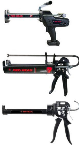
A7+ Dispensing Tools