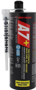
A7P-28 28 ounce cartridge