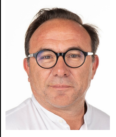
Petros KOKKALIS Greece

Committee on Civil Liberties, Justice and Home Affairs Delegation for relations with Israel