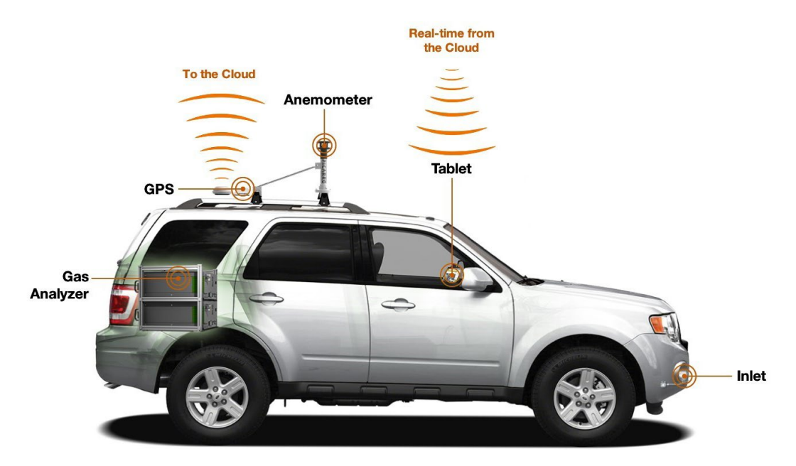
Diagram of vehicle-based advanced leak detection used for distribution systems.

EDF estimates that U.S. onshore gas pipeline methane leakage is between 3.75 times and 8 times greater than estimated by EPA