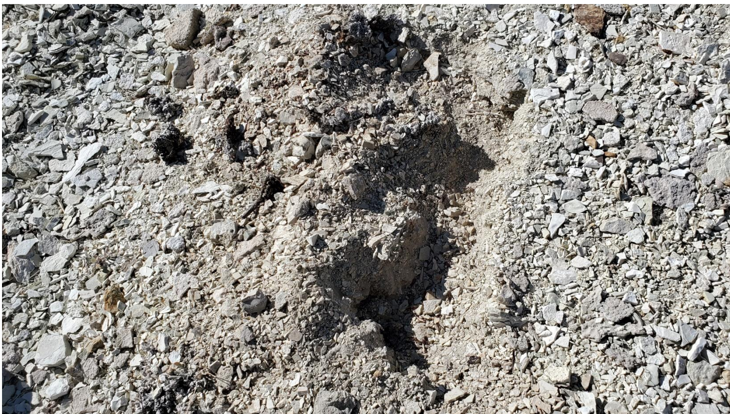
Figure 7: completely dug up plants, subpopulation 1.