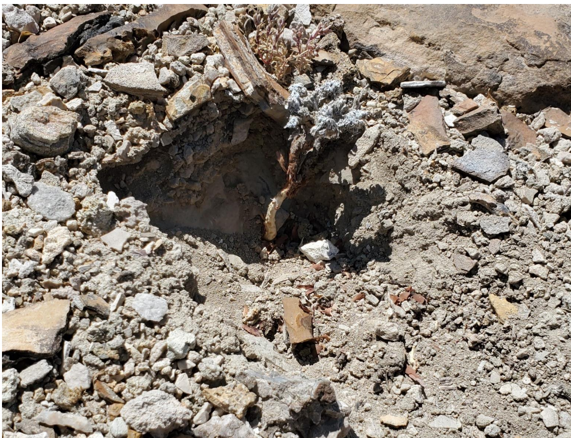
Figure 10: extant plants are remaining with taproots exposed and a large hole surrounding them.