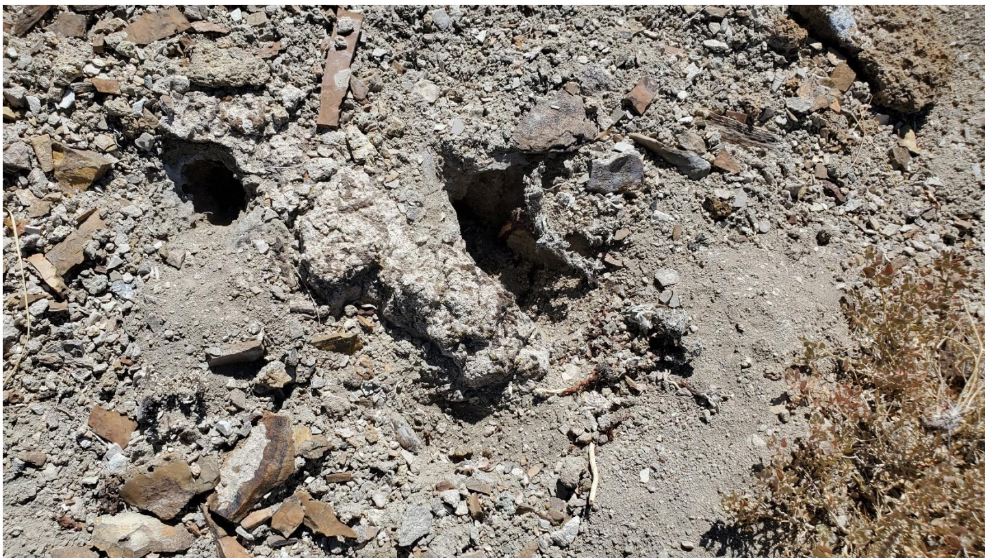
Figure 6: Dug up plants with detritus, subpopulation 2.