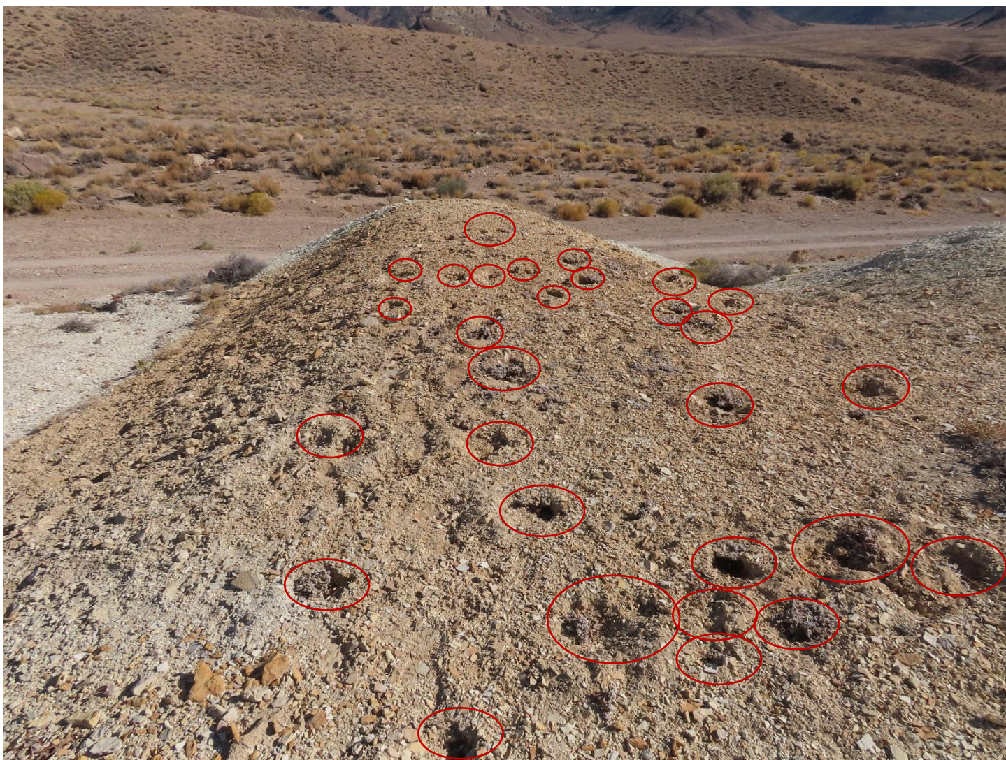
Figure 4: destruction at a single site near the access road at subpopulation 1.