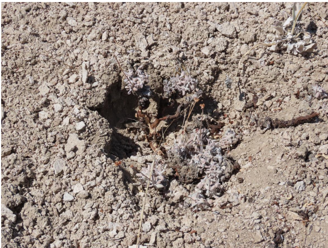
Figure 8: Destroyed buckwheat with loose pieces, exposed taproot, and small remaining rooted plants in subpopulation 1.