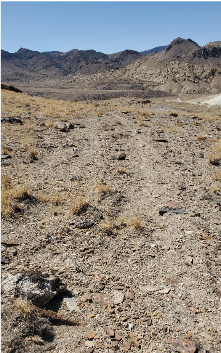
Figure 3: emerging social trail within subpopulation 2.

The emerging social trail pictured below in Figure 3 was on the east side of subpopulation 2. This area of subpopulation 2 experienced almost 100% extirpation. This trail was not observed in previous visits to be of the same level of use and definition. One might surmise this trail was further developed by repeated trips to haul out the buckwheat plants. We saw similar trails in all populations.