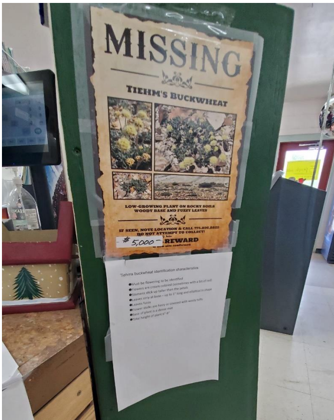
Figure 1: “missing” poster as posted in the Dyer general store on June 3, 2020.