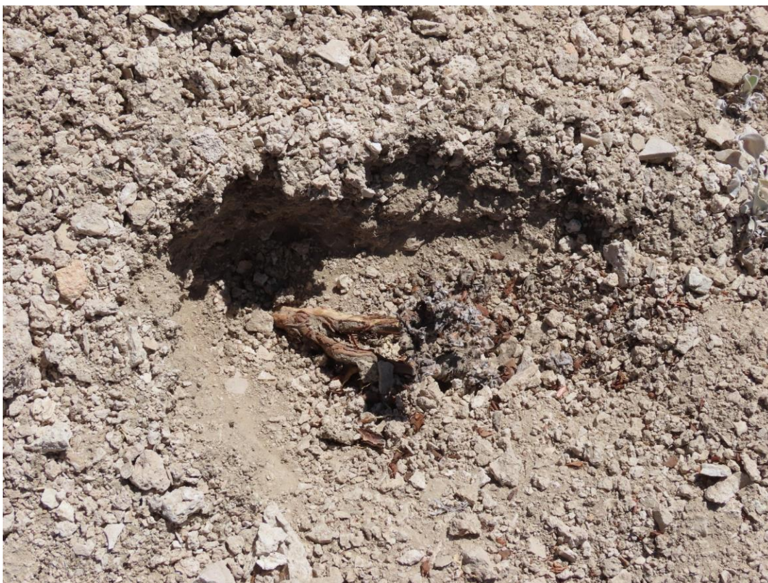
Figure 9: Exposed taproot, subpopulation 1