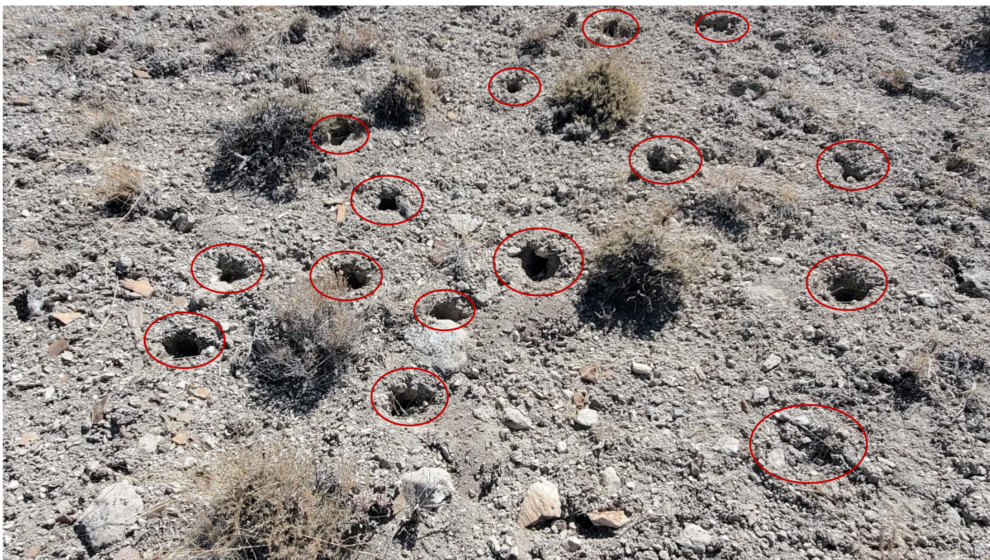
Figure 5: destruction in subpopulation 6b.