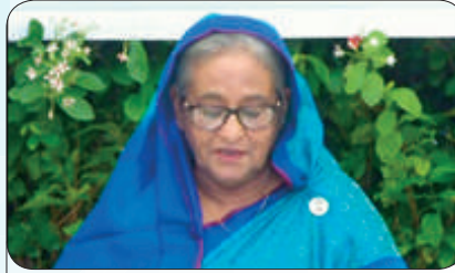
HPM chaired the CVF Leaders Event on 7 October 2020 and launched "Midnight Survival Deadline for the Climate" initiative calling all nations to deliver new and enhanced NDCs by 31 December 2020