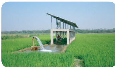
Drought tolerant crops