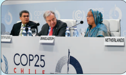
Hon'ble Prime Minister of Bangladesh, H.E. Sheikh Hasina, and United Nations Secretary-General, H.E. António Guterres at the CVF Leaders Event at COP25 on 2 December 2019