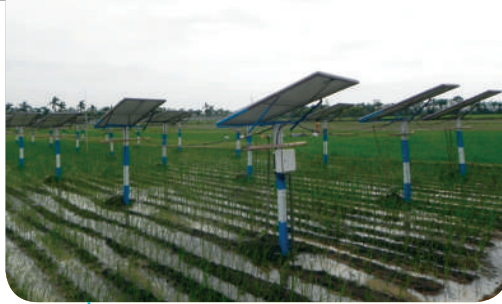
Agrivoltaic Solar Power Plant