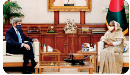
Meeting between Hon'ble Prime Minister of Bangladesh, H.E. Sheikh Hasina, and United State Special Envoy for Climate, H.E. John Kerry on 9 APRIL 2021