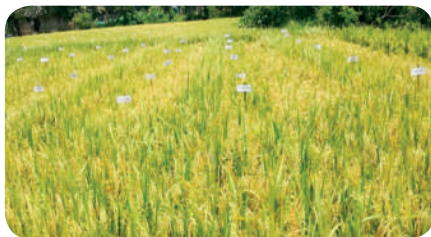
Salinity tolerant crops