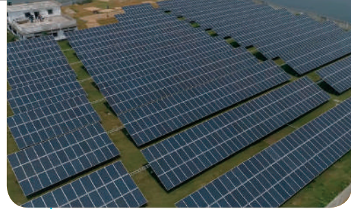
Solar Mini-Grid Plant