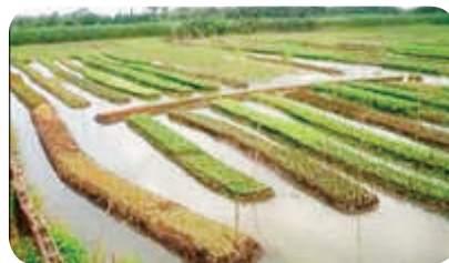
Floating vegetable cultivation