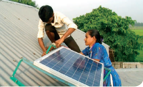
Solar Home System