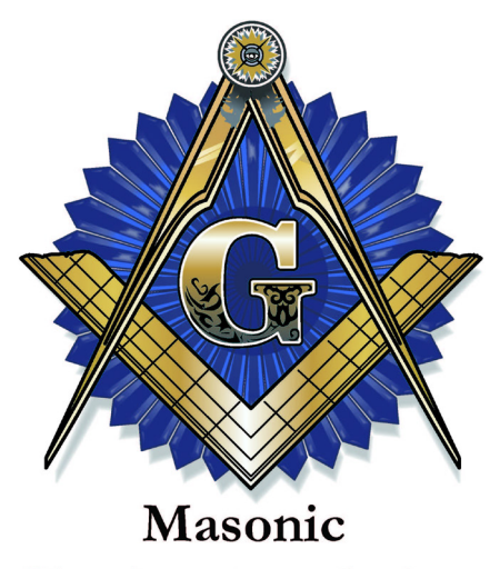
Charity Foundation of Oklahoma