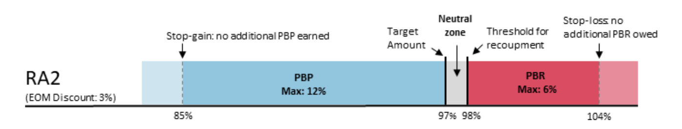
Total performance period expenditures as percentage of benchmark amount

Under the terms of the participation agreement, EOM participants will be required to comply with the CEHRT requirements described in section V.B.iii. We expect that both risk arrangements will qualify as MIPS APMs, and that RA2, which requires the EOM participant to take on increased downside risk, will qualify as an Advanced APM (as further detailed in section VI.A.)