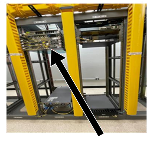
Server rack showing Fujitsu 1Finity optical networking platform