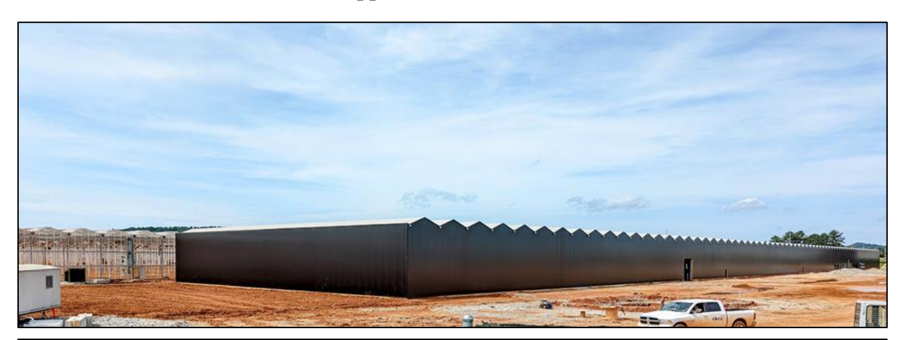
Figure 3.1 AppHarvest, Somerset