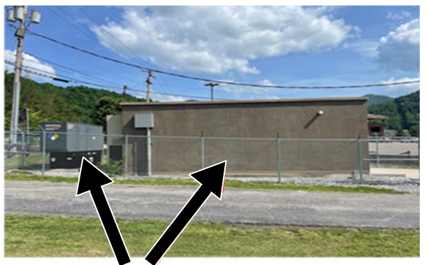
Communications equipment shelter showing backup generator for potential loss of power